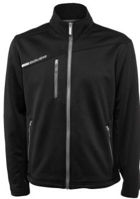
Flex Tech Fleece